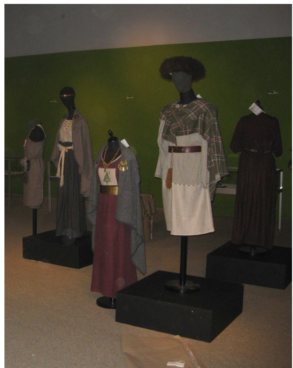
The exhibition “(R)EVOLUTION der Mode. Vom Mammutfell zum Minirock”: some prehistoric garments.