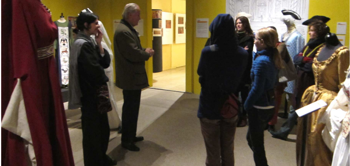
Visiting the exhibition “(R)EVOLUTION der Mode. Vom Mammutfell zum Minirock“: here in the room with late medieval, renaissance and baroque reconstructed garments.

After this theoretical part we let the students find their costume, they like most from the prehistoric period, to see which garments we have to specify more.