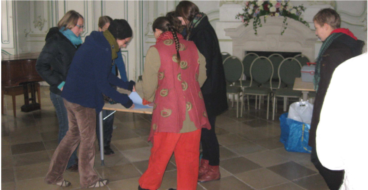
The Students write down their expectations.

First we had a round of introductions, where everybody describes his expectations with this workshop.