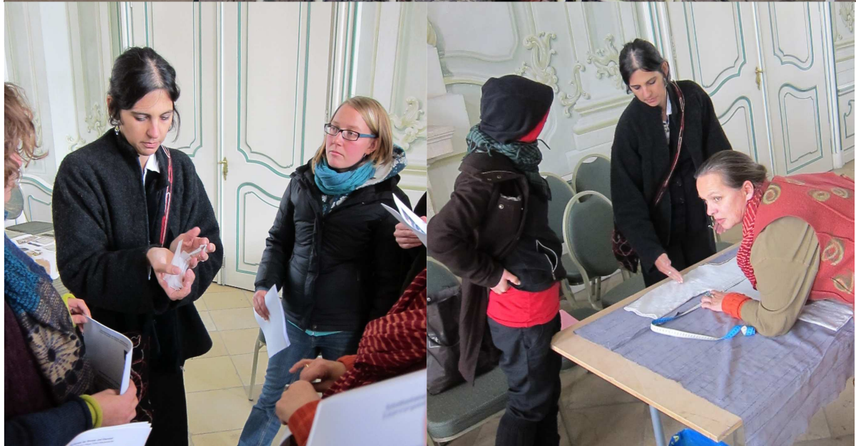
Working with prehistoric clothes patterns

Finally we had some individual discussions about their working progress in the Hallstatt -Textiles project and gave some advice for literature about Bronze Age and Iron Age Textiles and everything in connection within.