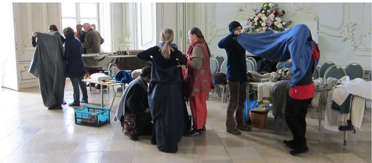
Students working on their new creations

For the next step - a creative part - we prepared garments like the peplos, tunicas, skirts, trousers, capes, different hats, veils, shoes and puttees and the elements of the jewellery like needles and fibulas. Then the students had to choose some of these ancient clothing types and create something new out of them and present their creations. After the presentation we show how the garments were worn and fixed in Prehistory based on the location of needles and fibulas in graves.